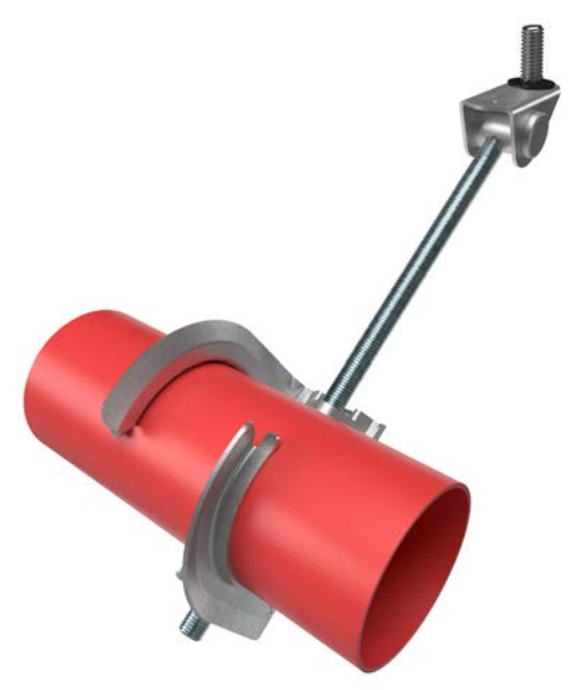
Fig. 74 and Fig. 77 assembly