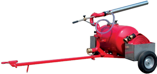
Concentrate drum is optional