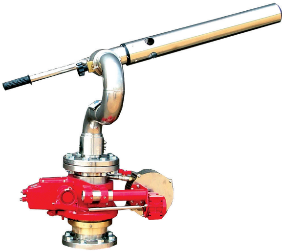
Shown with optional polished stainless steel finish and foam/water branch pipe