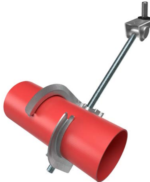
Fig. 74 and Fig. 77 assembly